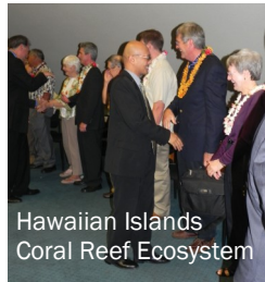
Hawaiian Islands Coral Reef Ecosystem

Creates affordable rental housing development program. Allows nonprofit organizations to acquire expiring federal Agriculture or Housing & Urban Development housing contracts and ensures that sites remain affordable rental housing. SB 903 Affordable Rental Housing