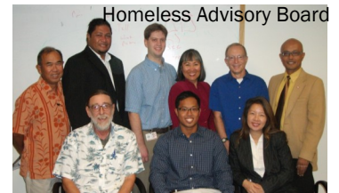
Homeless Advisory Board

Authorizes family court to issue financial restraining orders and consider concealment of or failure to disclose income or asset, or violation of a restraining order in issuing further support orders and awarding payment of attorney fees and costs. HB 909 Divorce